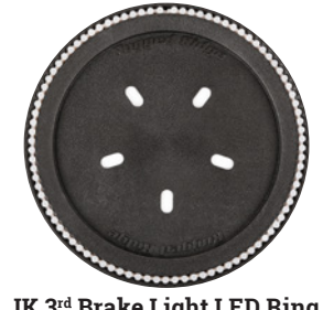
JK 3<sup>rd</sup> Brake Light LED Ring № 11585.04