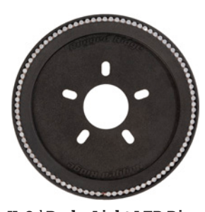
JL 3rd Brake Light LED Ring № 11585.06